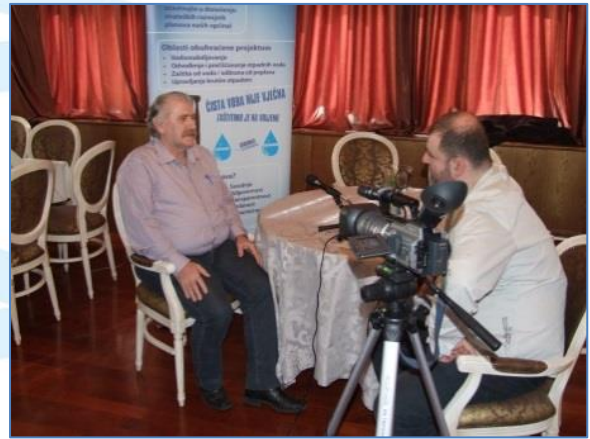
"Public relations and public appearance" training, 17/3/2013