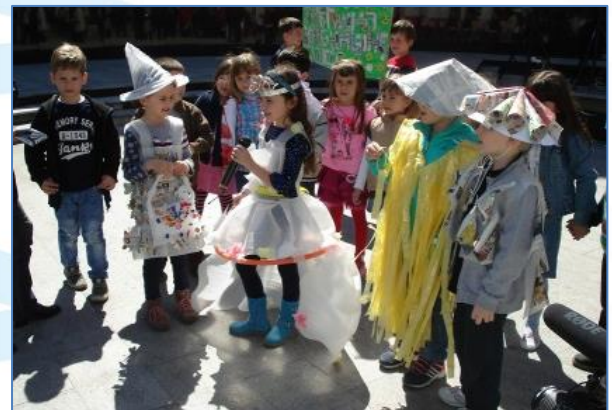
Performance at the town square in Bihac, 19/4/2013

First educational workshop for children in kindergarten initiated the activities on informing and awareness rising of kindergarten and school children and citizens in local communities in all municipalities of USC and municipality of Drvar.