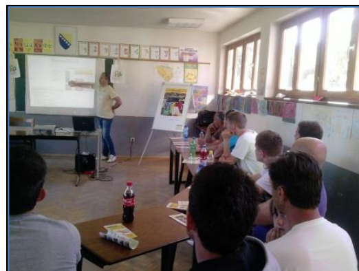
Workshops in local communities