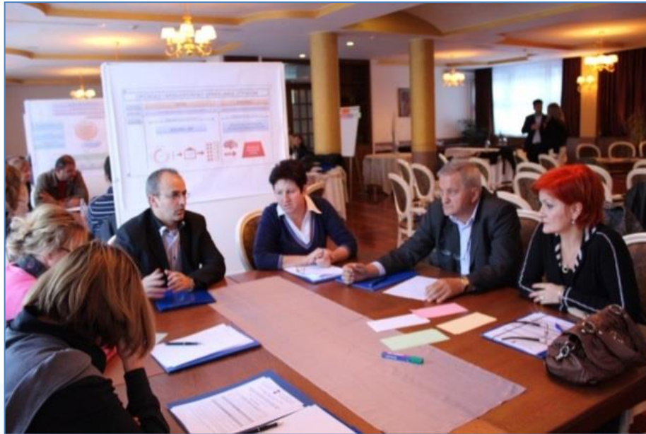
"Waste Management Plan" Workshop