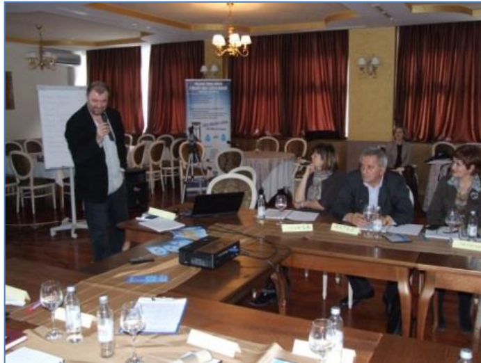
Education of surveyors