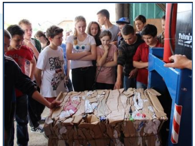
Educational workshops in kindergartens, primary and secondary schools