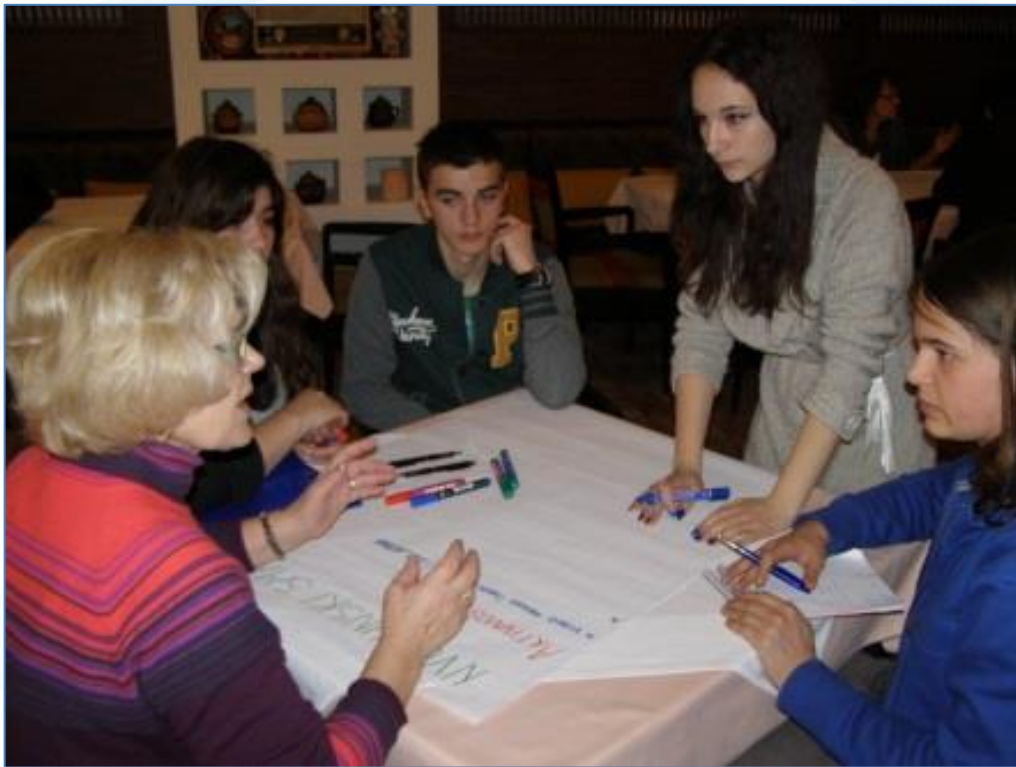
Training for NGOs on integrated solid waste management 21 and 22/3/ 2013)

In the first phase of the Campaign, representatives of non-governmental organizations participated to trainings on integrated solid waste management and public relations. The purpose of these trainings was to strengthen the capacities of NGOs for better implementation of the above mentioned activities and adequate informing of all interested parties.