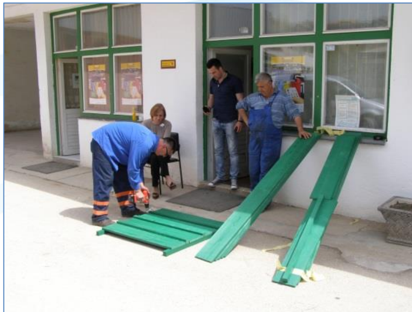
Experimental composting plant in construction, Kljuc

After the deadline of 45 days project evaluation team will evaluate the success of this project by counting the constructed composting plants in each local community. Evaluation team will then compile a list of the most successful local communities at the municipal level, and give them their rewards.