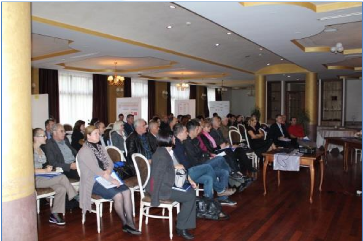
The first informative workshop – ISWM Campaign, October 2012

In the previous period many activities have been realized, starting with information sharing with all stakeholders and professional trainings at the beginning of this project.