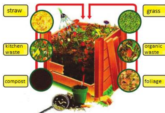
Bio-waste composting process