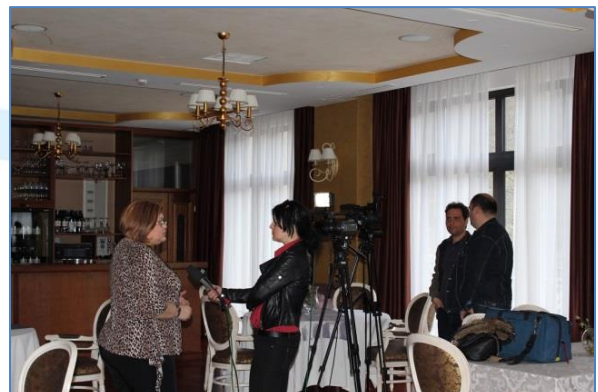
Working meeting with media representatives, 12/4/2013