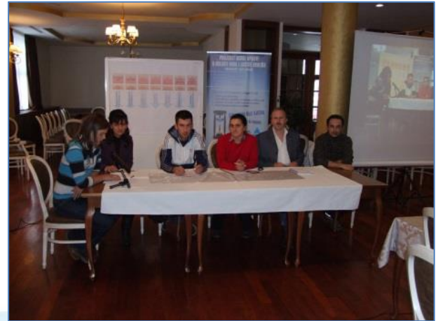
"Public relations and public involvement" training 27/3/2013

After the preparatory activities, an introductory press conference and performance have been organized and held at the town square in Bihac for the purpose of informing the general public.